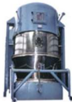
Fluidised Bed Drive

Corporate Social Responsibility: Save electricity, save space, and generation of employment.