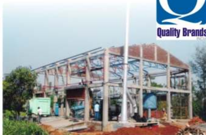
Aromatic Distillation Plant

Products: Food process equipments. Aromatic distillation unit