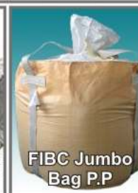
FIBC Jumbo Bag P.P