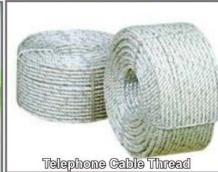
Telephone Cable Thread