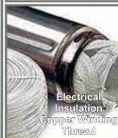
Electrical Insulation Copper Winding Thread