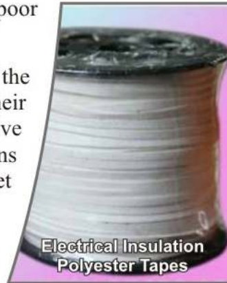
Electrical Insulation Polyester Tapes