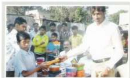
GIFT DISTRIBUTION @ Juvenile Home