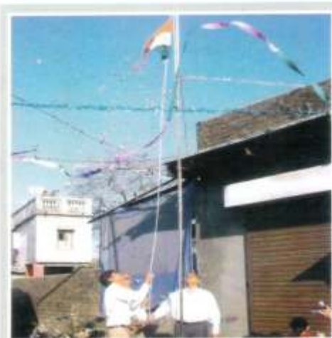
FLAG HOSTING WITH LABOUR COMMISSIONER @ Government School

Corporate Social Responsibility: I am also an active member of Damania Soni Samaj, Junior Chamber (International) of Commerce, Madhav Saraswati Sishu Mandir Trust.