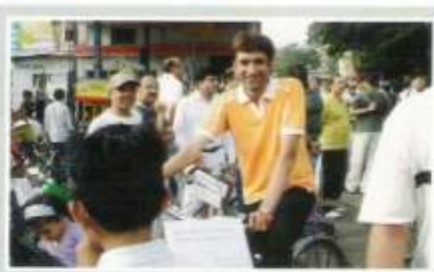
SAVE PETROL RALLY @ Surat