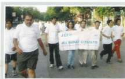
WALK FOR HEART @ Surat

Expansion plans: After achieving success in south Gujarat area we further plan to spread wings in the remaining area of Gujarat.